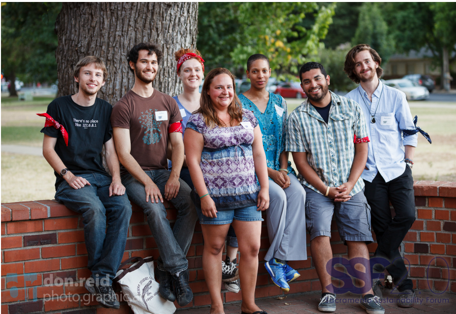
Student sustainability leaders representing half a dozen educational institutions in the region met for the first time at SSF 2.0 June 14' event. Collectively on their own initiative they approached SSF 2.0 planning team seeking mentorship and support to bring sustainability into their schools.